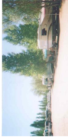
Category 1 Walker River Resort