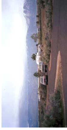
Category 2 Washoe Lake State Park