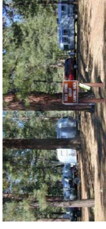
Category 3 Boca Springs