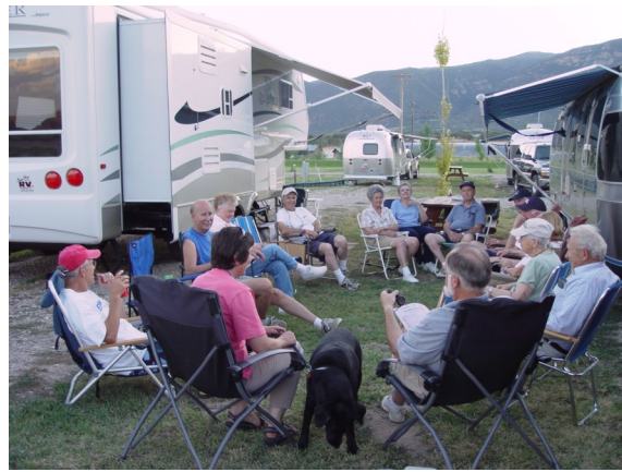
After dinner conversation

We continued to keep an eye to the sky on the fire, that was approaching the town of Fountain Green, ready to pull out if necessary. We had a fantastic view of it and also the fireworks later that night. A much needed rain shower came through and has helped dampen the fire's spirit.