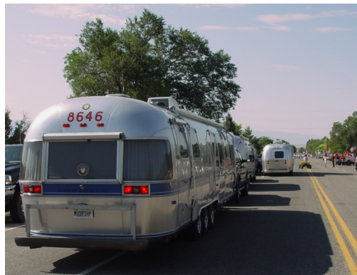
Lined up ready for the parade