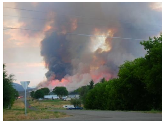
View from Fountain Green Sunday evening, the town was put on evacuation alert.

We all enjoyed a wonderful pot luck dinner prepared by the ladies, some of the women made posters to be used in the parade Saturday morning. Geniel came to the rescue providing various supplies to complete the job.