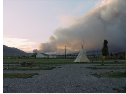
View from Burns Brothers Campground